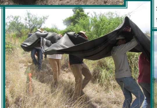
Thanks to everyone who made this possible!

for a few minutes!). Three professionally designed wetlands were shaped, lined, landscaped, and receive water via two new solar systems, also funded through a Partners grant.