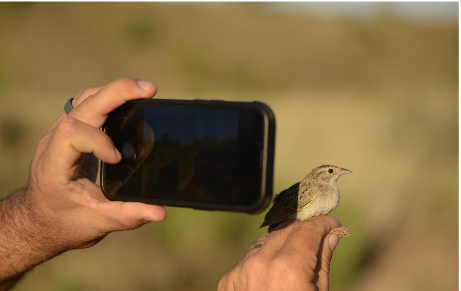
Photographing a Cassin's Sparrow recently marked with a solar powered Motus tag.