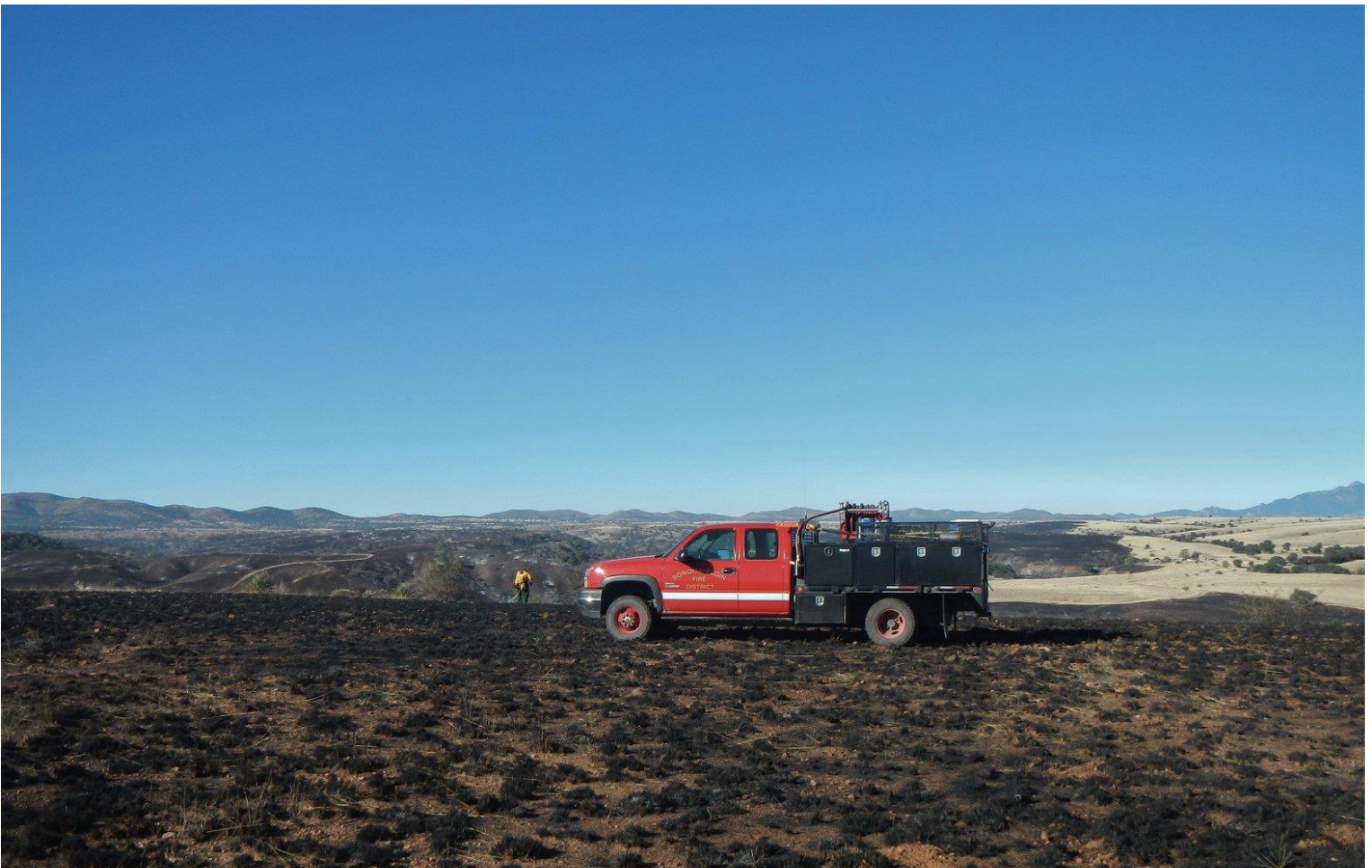
The Sonoita-Elgin Fire District assessing the scene after the 2018 Babo Fire, the most recent significant burn on the AWRR.