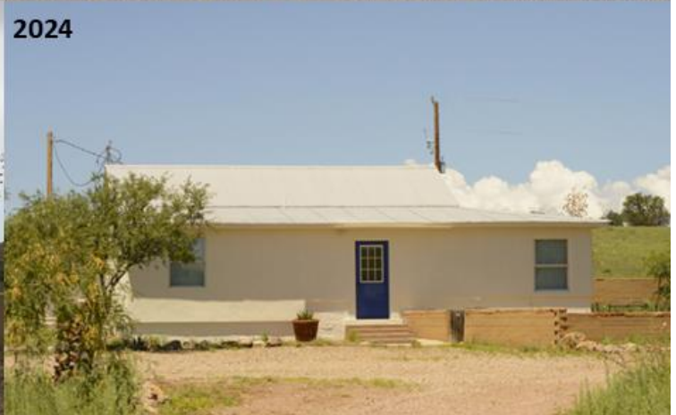
The Swinging H Ranch House over time.