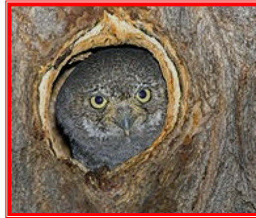
...and an Elf Owl in a Chinaberry tree.....