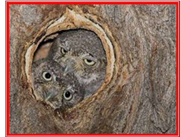
Elf Owl